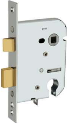
LK2751 Mortice Lock