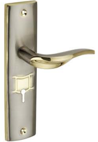
MS2728 Finish : Gold Silver