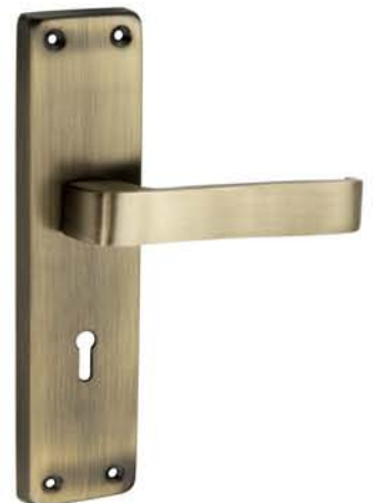
MS2724 Finish : Brass Antique