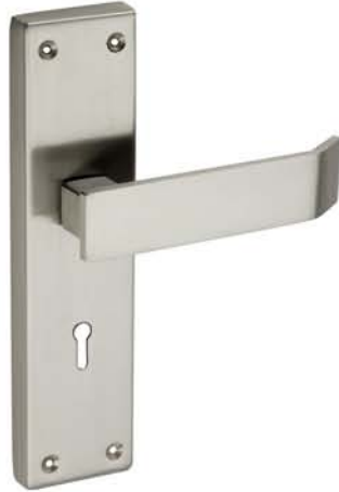
SS2738 Finish : SS