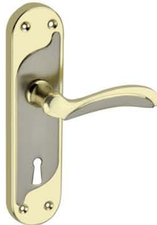
MS2719 Finish : Gold Silver