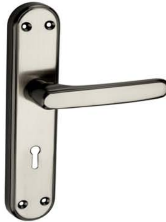
MS2703 Finish : Black Silver