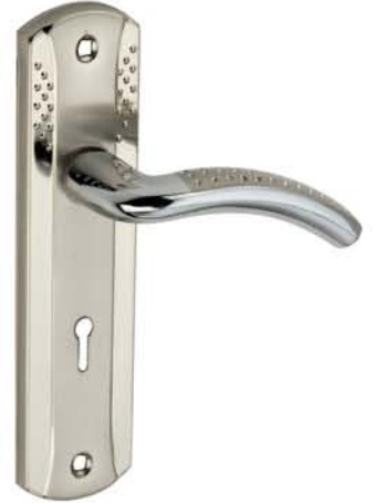
MS2716 Finish : SS