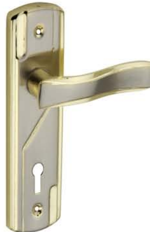
MS2731 Finish : Gold Silver