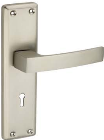
MS2709 Finish : SS