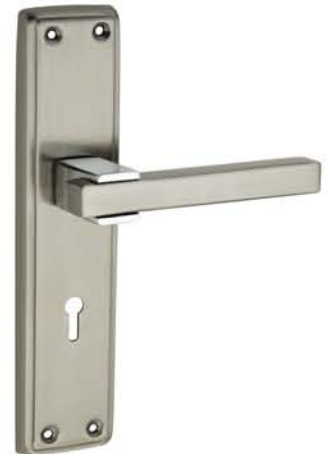
SS2744 Finish : SS