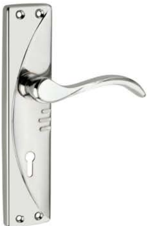
MS2733 Finish : Chrome