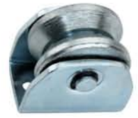
AC3020 Size : 40MM