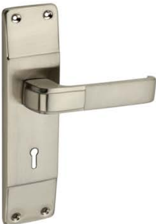
MS2721 Finish : SS