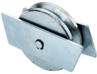
AC3017 Size : 100MM