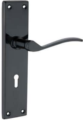
MS3002 Finish : Glossy Black