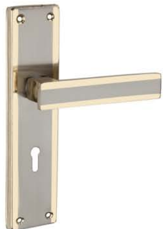
MS3012 Finish : Gold Silver