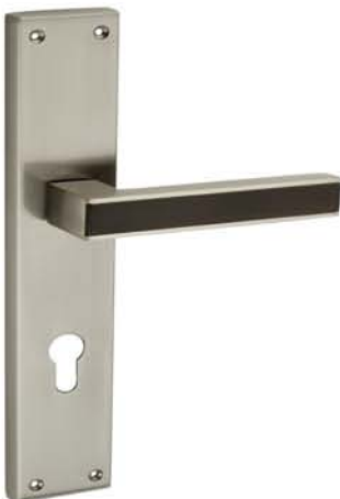
SS2745 Finish : SS