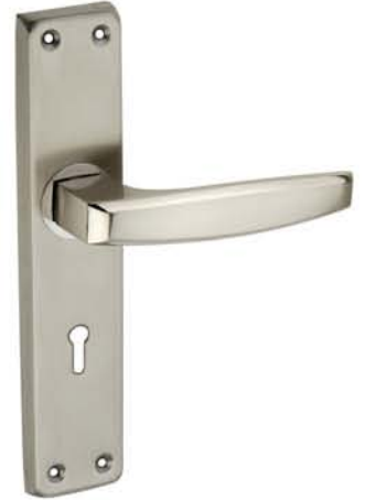
SS2740 Finish : SS