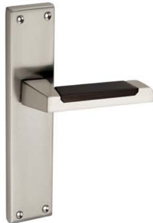
SS2743 Finish : SS