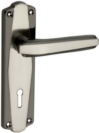
MS2701 Finish : Black Silver