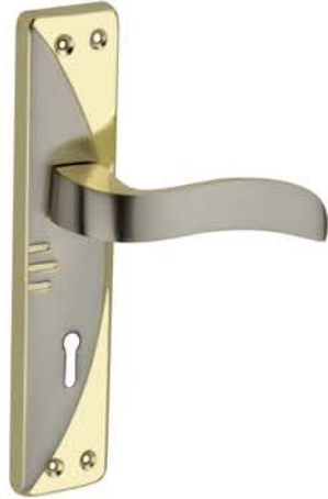
MS2726 Finish : Gold Silver