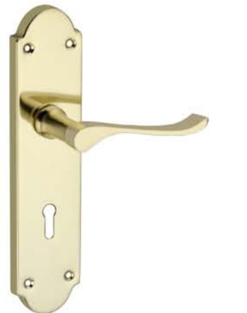
MS2712 Finish : BP