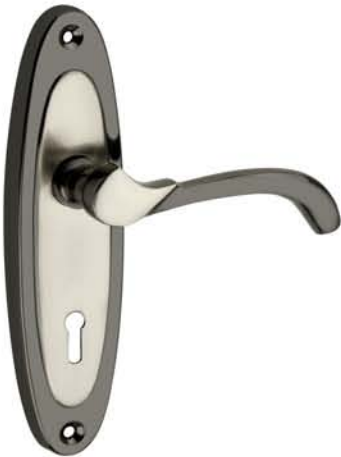
MS2705 Finish : Black Silver