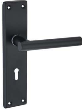
MS3003 Finish : Matt Black