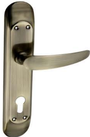
MS2730 Finish : Brass Antique