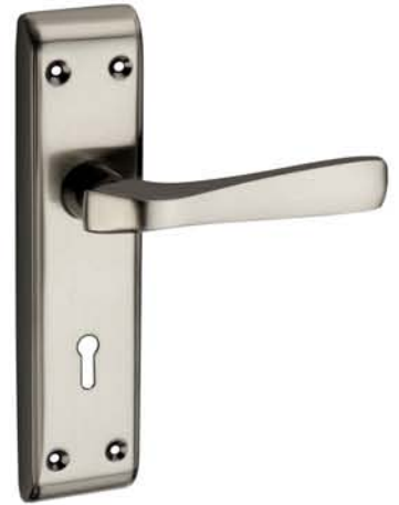
MS2704 Finish : Black Silver