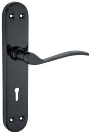
MS3006 Finish : Glossy Black