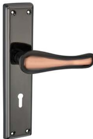
MS3011 Finish : Black Antique