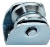
AC3019 Size : 60MM