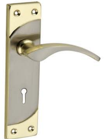
MS2720 Finish : Gold Silver