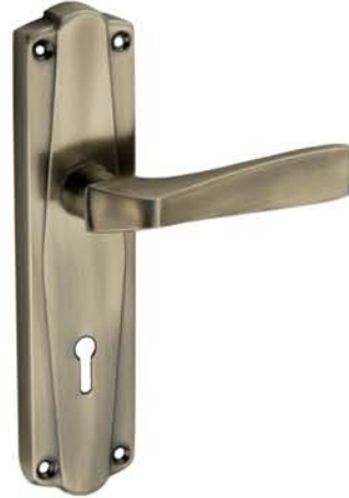
MS2715 Finish : Brass Antique