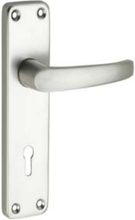
AL2737 Finish : Anodized