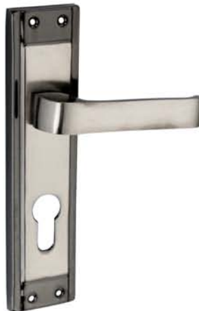
MS3007 Finish : Brass Silver