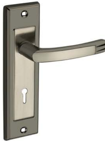
MS2707 Finish : Black Silver