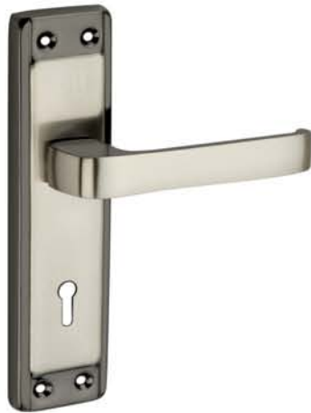
MS2706 Finish : Black Silver