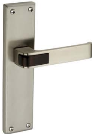
SS2742 Finish : SS