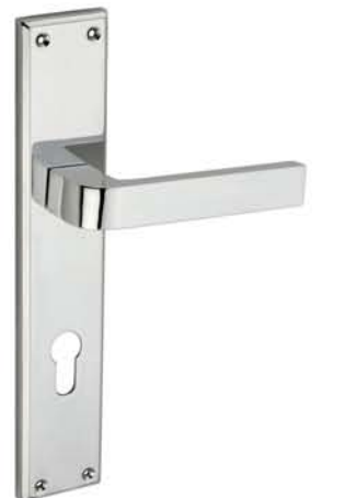
ZN2736 Finish : Chrome