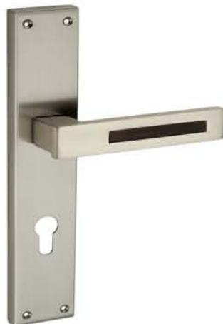
SS2746 Finish : SS