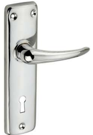
MS2732 Finish : Chrome