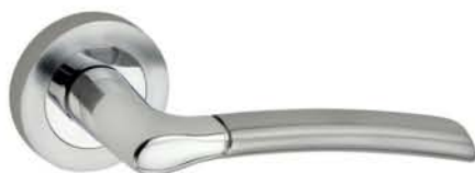
AL2749 Finish : SS