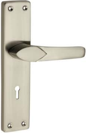
MS2725 Finish : SS