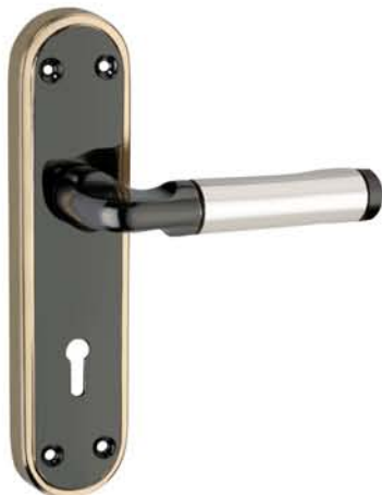
MS3010 Finish : Black Gold