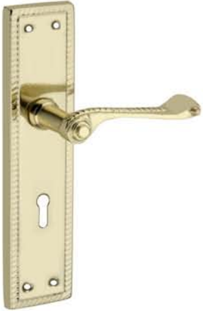
MS2713 Finish : BP