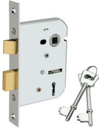
LK2752 Mortice Lock