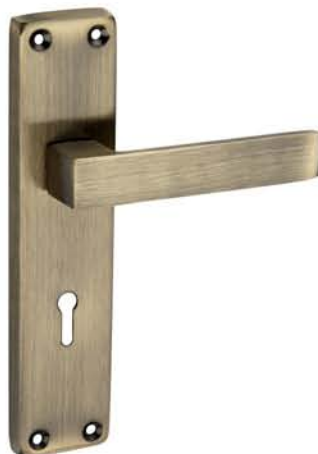
MS2722 Finish : Brass Antique