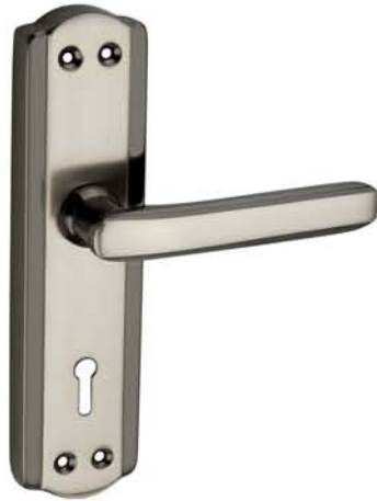
MS2702 Finish : Black Silver