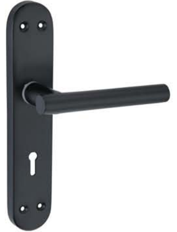
MS3004 Finish : Matt Black