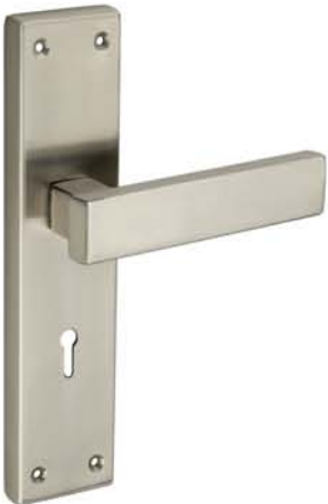
MS2729 Finish : SS