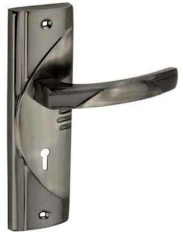
MS2708 Finish : Black Silver