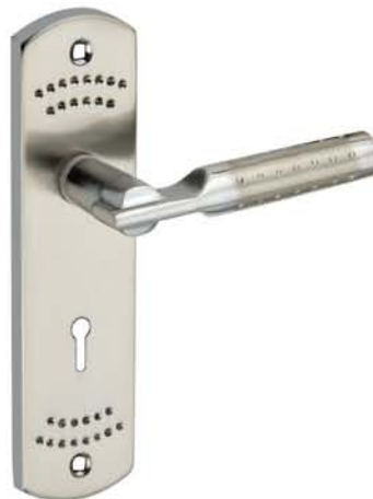
MS2711 Finish : SS