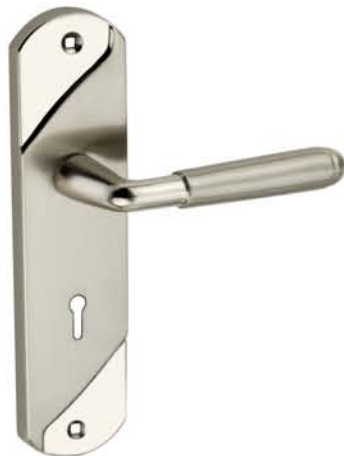
MS2710 Finish : SS