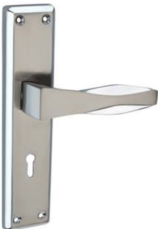
MS3009 Finish : SS