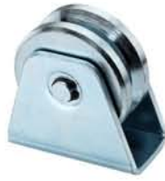
AC3018 Size : 80MM