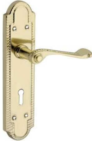
MS2714 Finish : BP