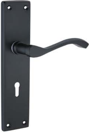
MS3001 Finish : Matt Black