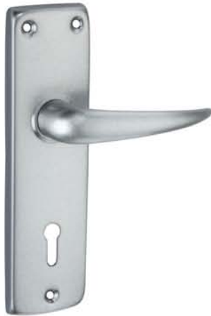
MS3014 Finish : Silver