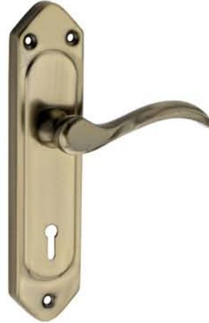
MS2727 Finish : Brass Antique