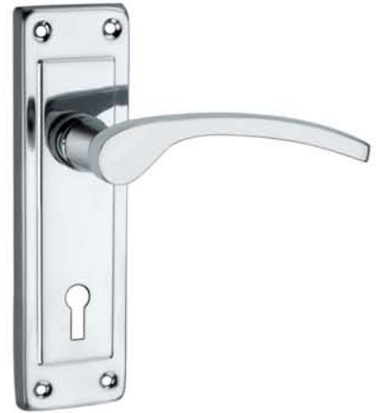
MS3016 Finish : Chrome