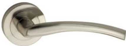
AL2747 Finish : SS