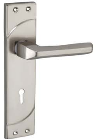
MS3008 Finish : SS