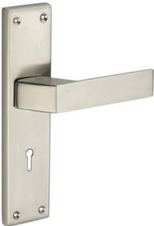
SS2741 Finish : SS