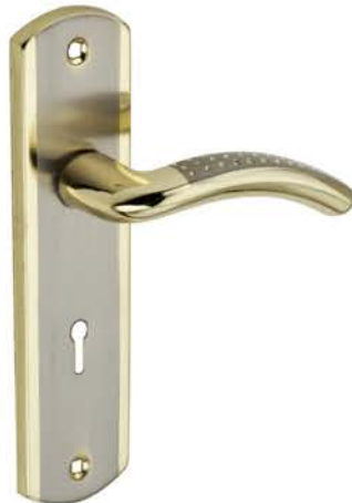
MS2718 Finish : Gold Silver