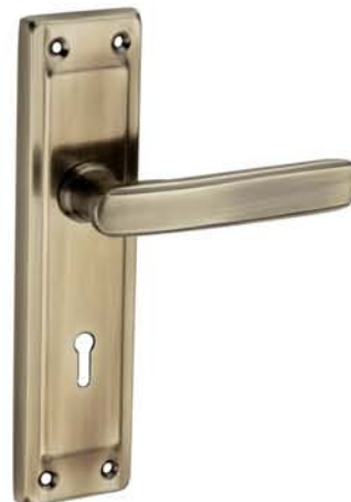
MS2723 Finish : Brass Antique