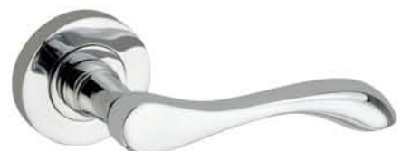
AL2750 Finish : Chrome