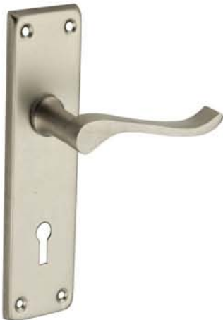
MS2717 Finish : SS