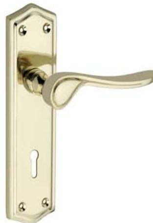
ZN2735 Finish : BP