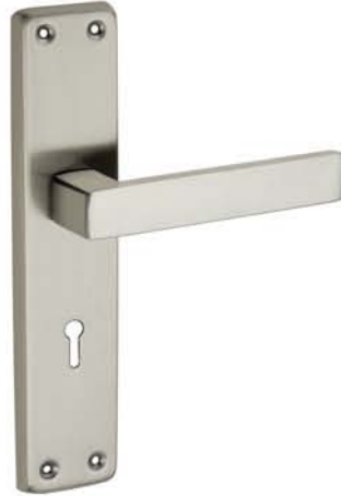
SS2739 Finish : SS