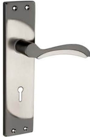
MS3015 Finish : BlackSilver