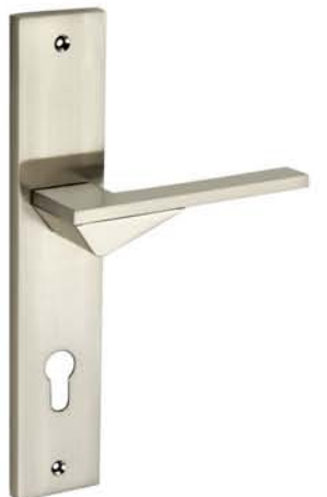
ZN2734 Finish : SS