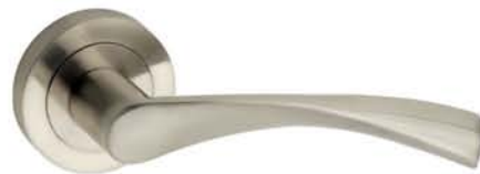
AL2748 Finish : SS